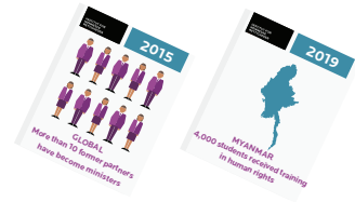
PROVEN TRACK RECORD